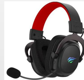
2.4G+BT of GP076 with RGB