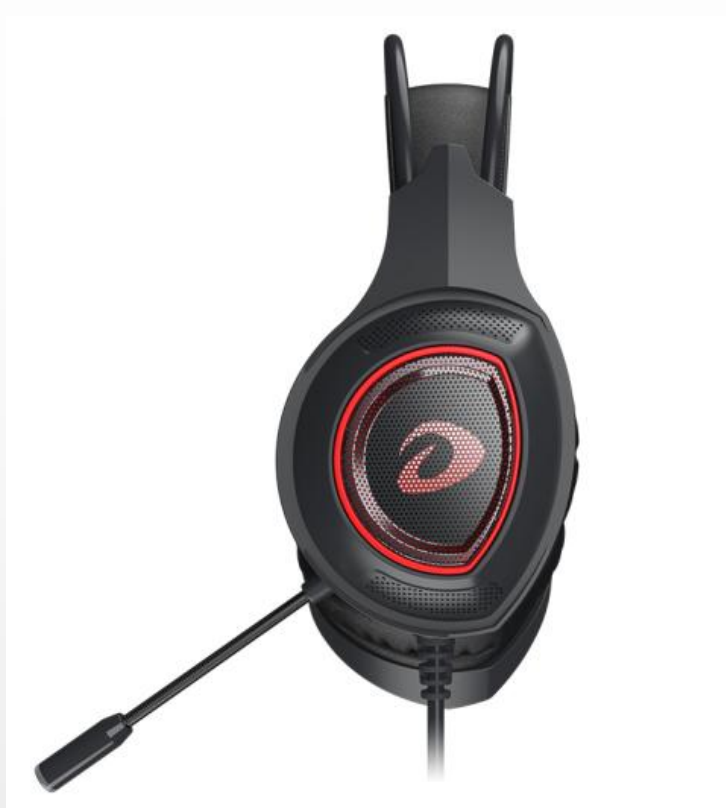
GP021 with LED