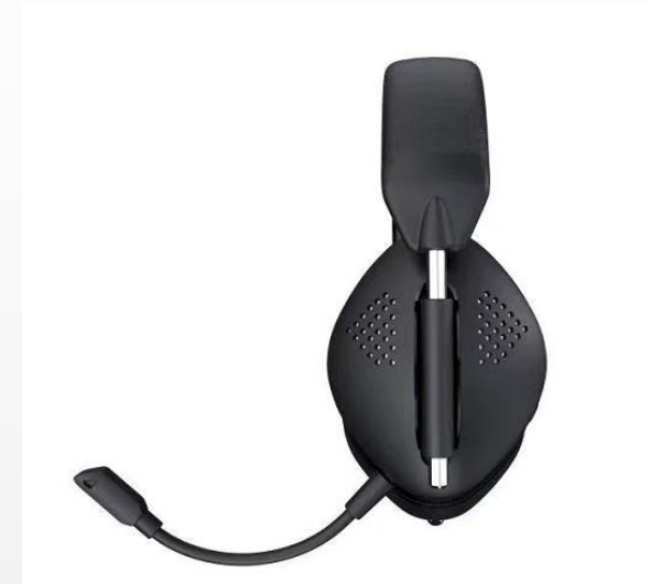
GP090 2.4G+BT+Type-c cable