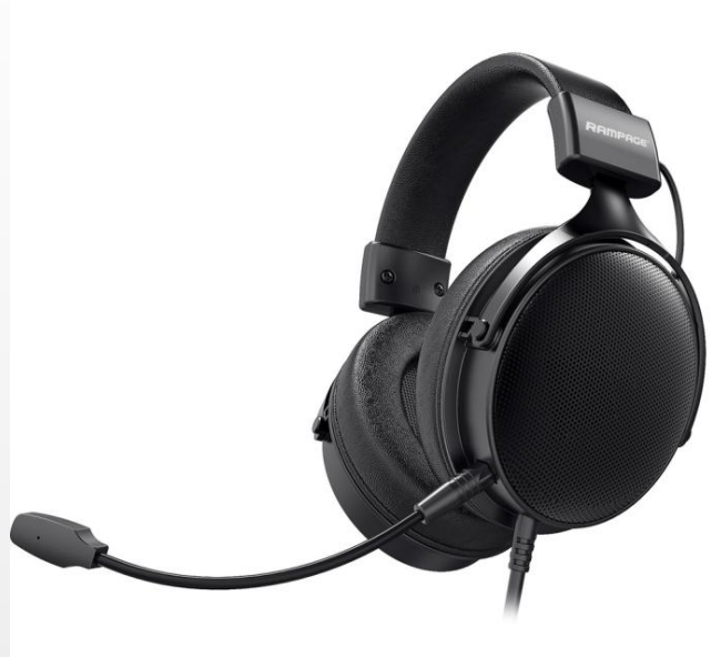
GP049 with steel net