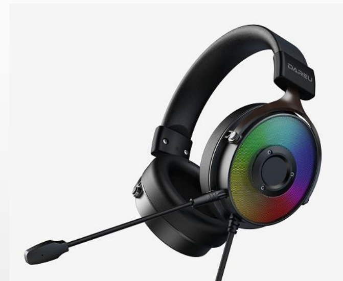
GP049 with RGB