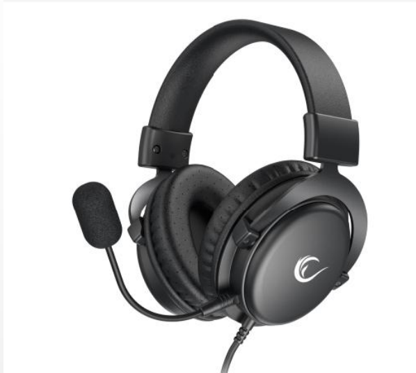
GP036 model is low end of this serial and for expand market