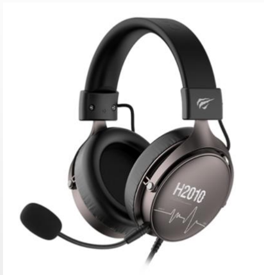
GP049 with steel cover