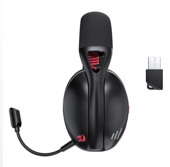
GP089 2.4G+BT+Type-c cable