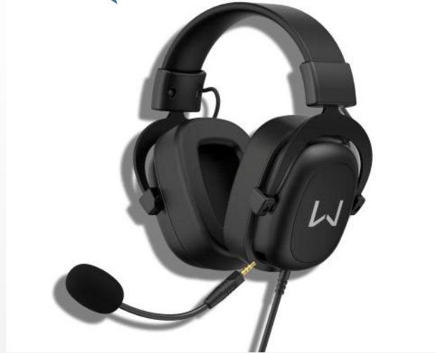
GP038 model is middle end of this serial and for profesional people