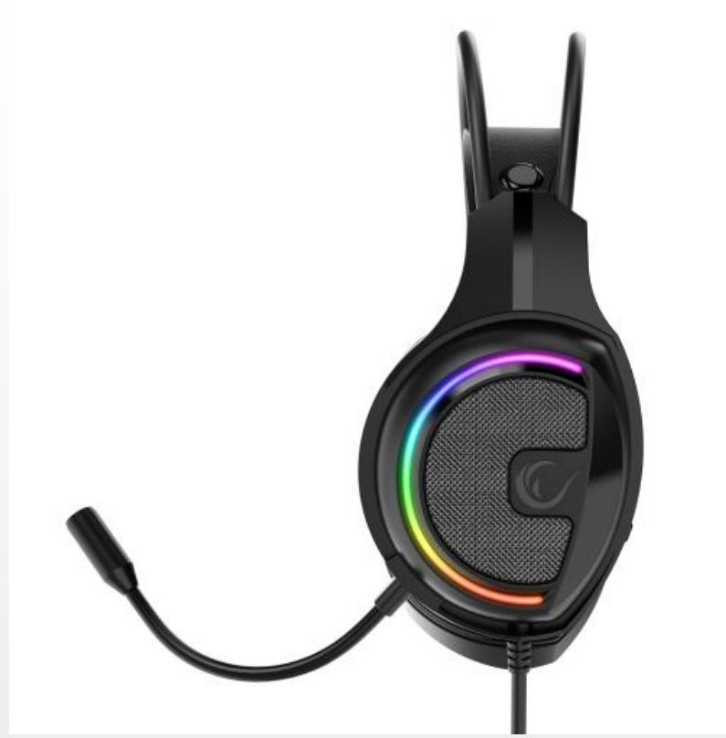
GP021P with RGB