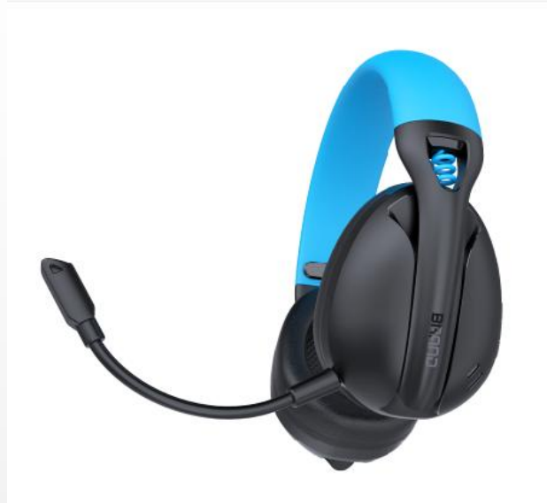
GP088 2.4G+BT+Type-c cable