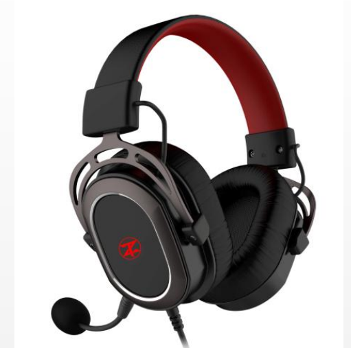
GP042 model is high end of this serial with EQ model and noise reduction function that for professional gamer.